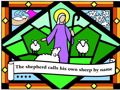
© 2007 J. S. Paluch Company, Inc.

905 W. Lake Blvd. Tahoe City, CA 96145 530-583-4409